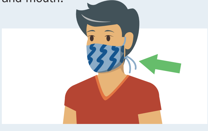
Masks should fit snugly, be secured with ties or ear straps, and not restrict breathing.