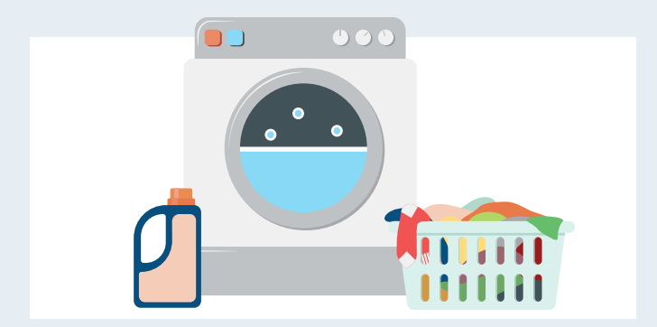
Your mask or face covering should be able to be machine washed and dried.