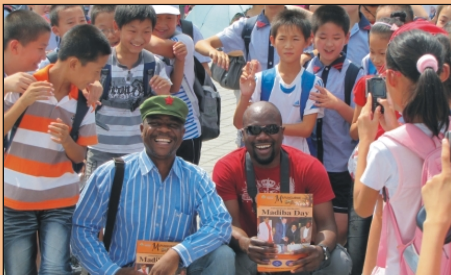
Loved by all..... even kids visited the South African pavilion.