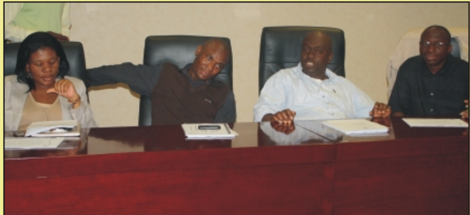
In attendance..... Some of the managers at the session.