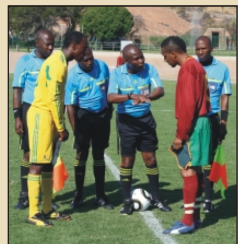
Heads or tail..... referees did a good job the championships.

Brazil will host the 6th World Championships.