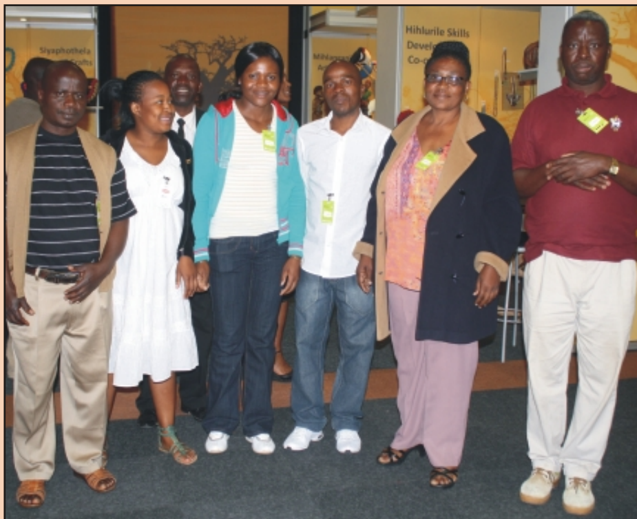
Teamwork..... group of exhibitors that represented Limpopo at the 17th Decorex.

Decorex Joburg 2010 once again showed why it's hailed as Southern Africa's largest and leading décor and interior design event.