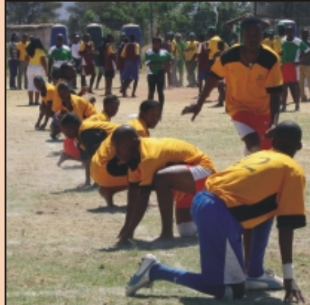
Indigenous run..... this athlete took part in the provincial indigenous game code Khokho at Bela-Bela.