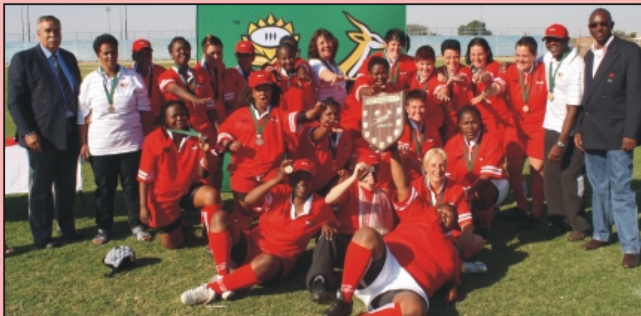
We are the champions..... Valke rugby team were celebrating winning the Bottom Five Women's Rugby victory at Seshego Stadium.