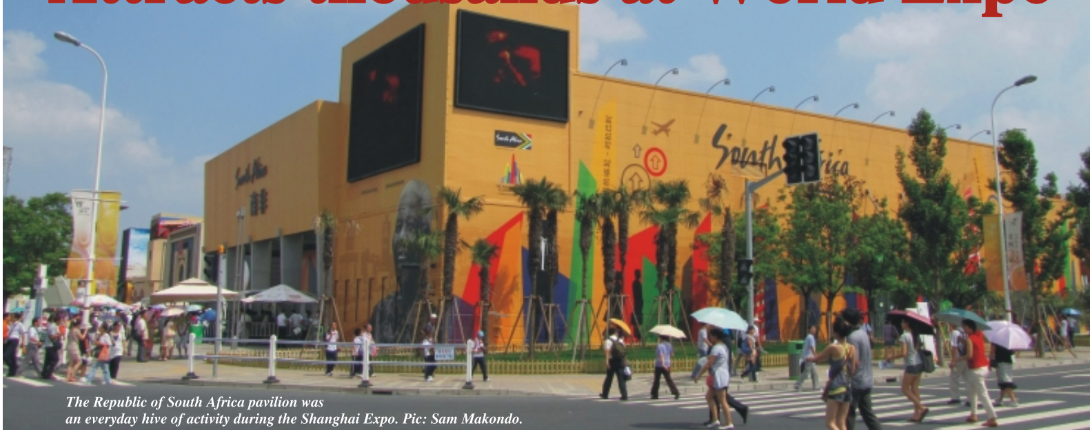
The Republic of South Africa pavilion was an everyday hive of activity during the Shanghai Expo.