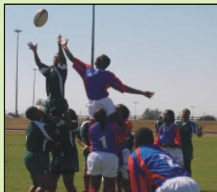
In the air..... Some of the hard moments that goes with the game.