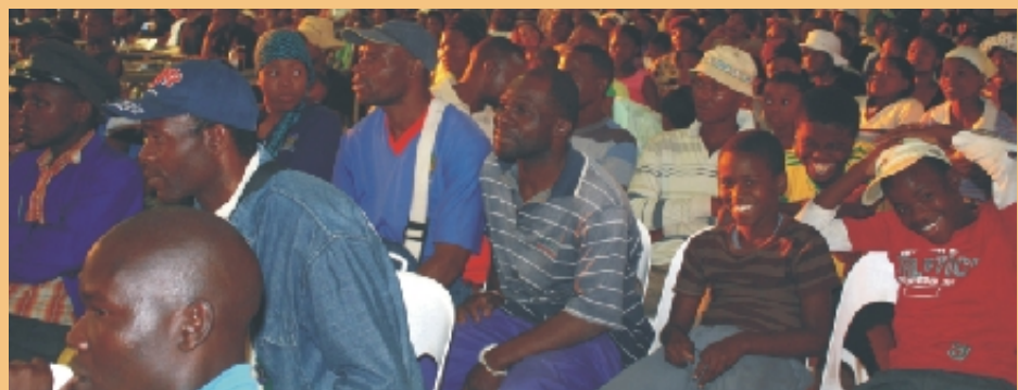
In attendance.....Fans of Ladysmith Black Mambazo packed the hall during the tour.

harmonies (isicathamiya being the traditional music of the Zulu people). Following their local success at wedding ceremonies and other gatherings, Tshabalala entered them into isicathamiya competitions. The group was described as 'so good' that they were eventually forbidden to enter the competitions, but welcomed to entertain them. Although they had been recognised as an isicathamiya group in 1964, they had been singing