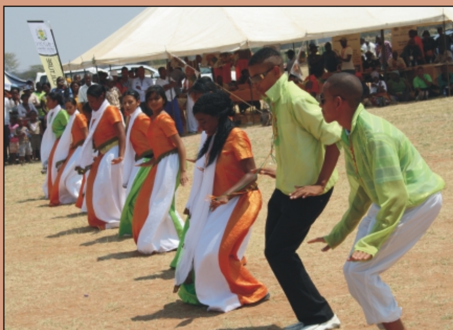
Get down.....Taxila entertained people at heritage day celebrations.