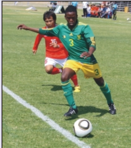
In charge..... South Africa taking on South Korea at Seshego stadium.

When the two countries took to the field in a hard fought contest, many were not that convinced that the