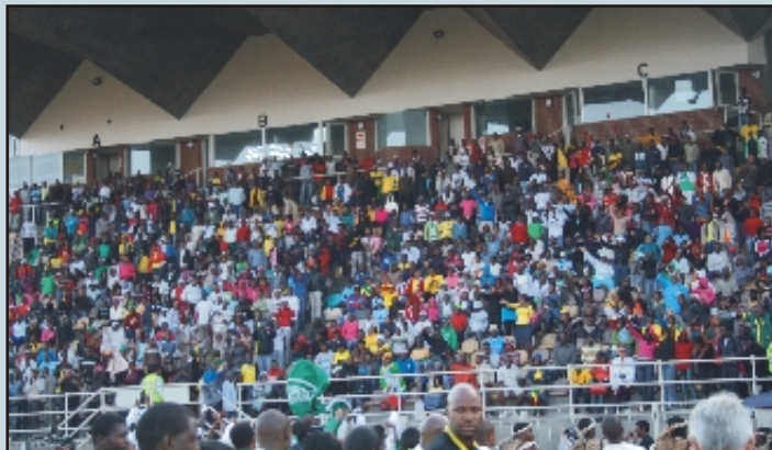
Packed to the rafters..... fans enjoying one of the INAS-FID championships matches.

The scores have been fascinating and the level of play was viewed as professional and international. All the teams played at least three games each in the first round of group stages. Fifa rules were also applied. Like any other games yellow and red cards were handed out to curb foul play.