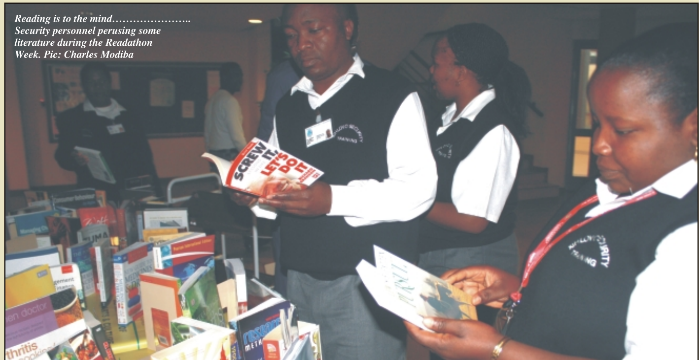
Reading is to the mind..... Security personnel perusing some literature during the Readathon Week.