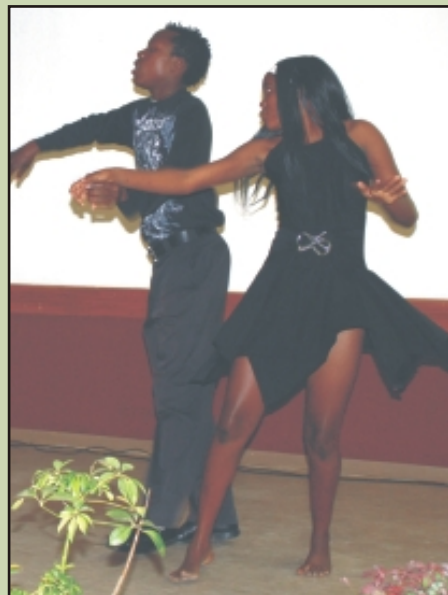
Nimble feet..... This Dance ensemble entertained the South African Squad.

INAS-FID is the international federation for athletes with intellectual disabilities. The World Football championship for intellectually impaired players is hosted by the country that hosted the FIFA World Cup in the same year of hosting the world cup. The 2014 World Football Championship for Intellectually Impaired athletes will be hosted in Brazil.