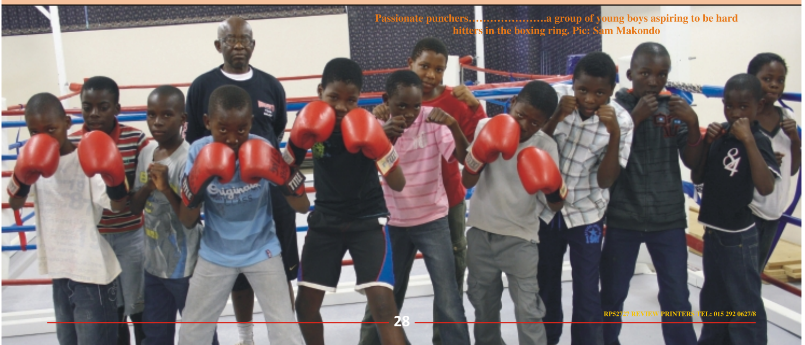
Passionate punchers..... a group of young boys aspiring to be hard hitters in the boxing ring.