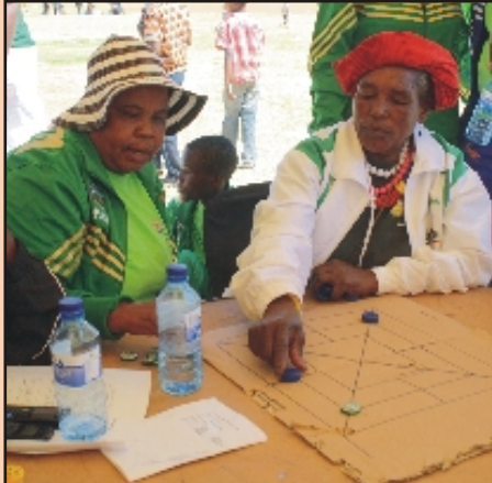
Killer move..... Morabaraba formed part of the games played at the Provincial Indigenous games.