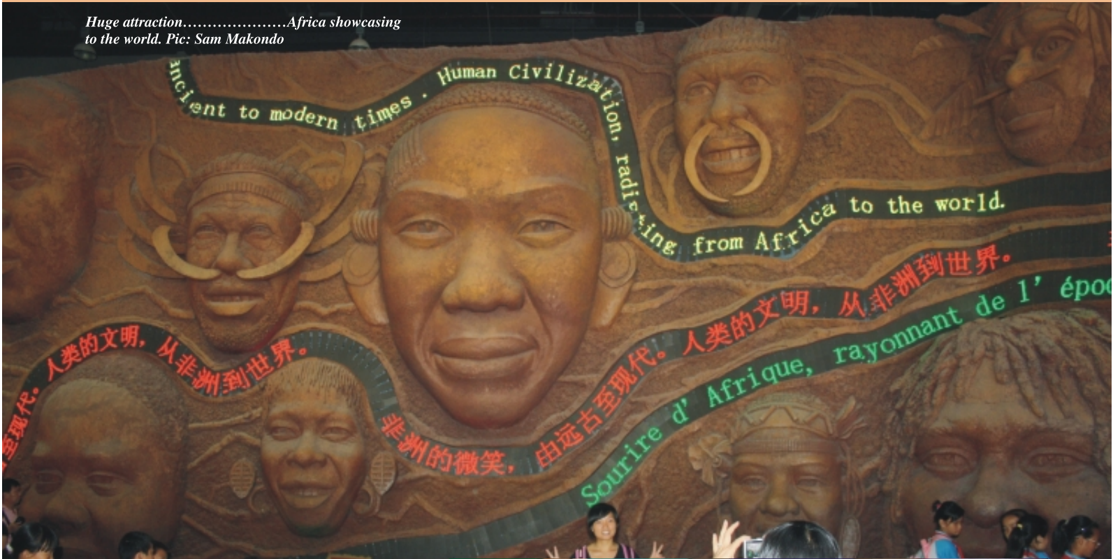
Huge attraction.....Africa showcasing to the world.

It surely was a proud moment to visit the South African pavilion, interact with the people of China and to be assured once more of the prosperous relations between the host and visiting countries.