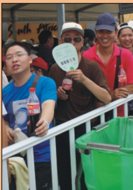
Patently queuing..... people braving the heat to visit the pavilion.

The Shanghai World Expo is the largest World Expo ever held with nearly 300 pavilions covering an area