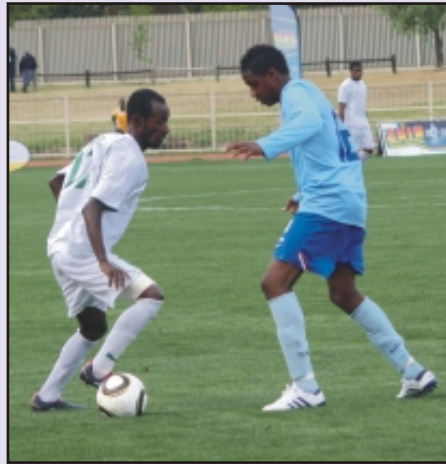
Enterprising..... Saudi Arabia against Netherlands at Peter Mokaba stadium.

best was still to come more especially after the FIFA World Cup that saw Spain crowned champions in South Africa's Soccer City. The games that followed produced an avalanche of goals with countries like Germany, Netherlands and defending champions Saudi Arabia scoring eight goals against Turkey and France respectively in their first round matches to the thrill of fans.