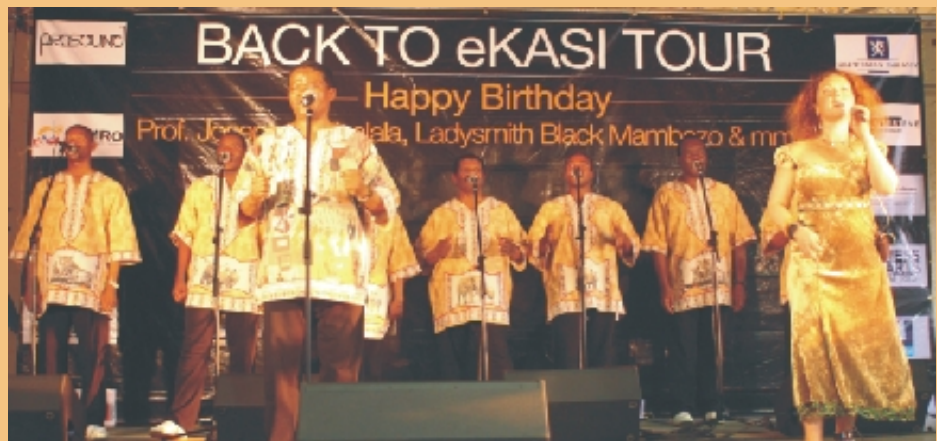
Happy birthday.....Legendary Ladysmith Black Mambazo performing at Bela-Bela Community Hall.

He further indicated that he formed Ladysmith Black Mambazo because of a series of dreams he had in 1960, in which he heard certain isicathamiya