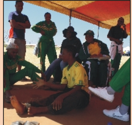
Watch it..... two athletes fighting it out to determine the best Diketo player.