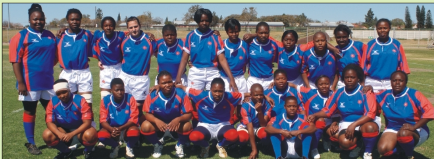
Team Limpopo..... this outfit took third position in the Bottom Five Women's Rugby tournament.