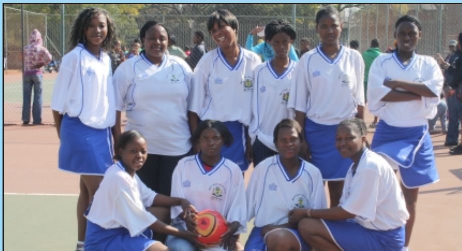
Team Limpopo..... netball outfit that represented the province at the first Inter-provincial championships for the Deaf.