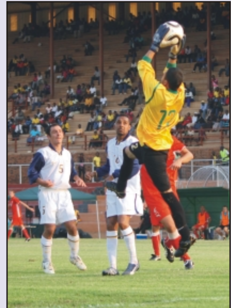
Best keeping..... Portugal against Poland at the Giyani stadium.

As if that was not enough, South Africa came back firing all cylinders following their opening loss against Poland to give South Korea a beating of their lives scoring 15 goals with no response from the Koreans. The South African score remains the highest in the tournament followed by Poland's 14-0 against South Korea.