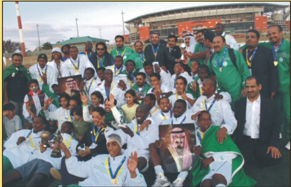
INAS-FID Champs..... Saudi Arabia successfully defended their championship at Polokwane's Peter Mokaba stadium.