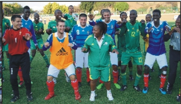
The Swans dance..... South Africa and France dancing together after their match.