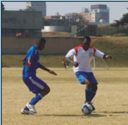
On the ball..... Limpopo player (white) showing some silky skills.