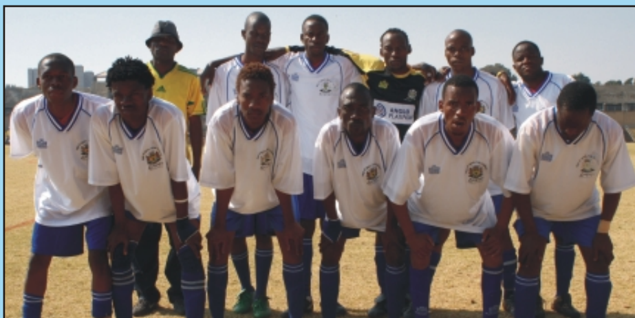
One love..... Football team that represented Limpopo at the championships.

"The Inter - Provincial Championships for 2011 will be held in Limpopo depending on the availability of