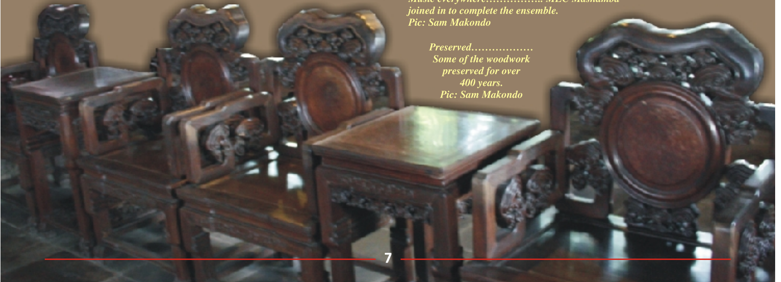
Preserved..... Some of the woodwork preserved for over 400 years.