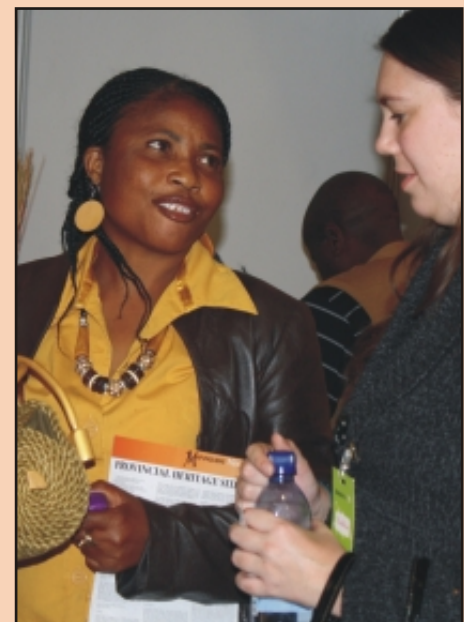
Bargaining..... Limpopo stall was the most visited at the Decorex.