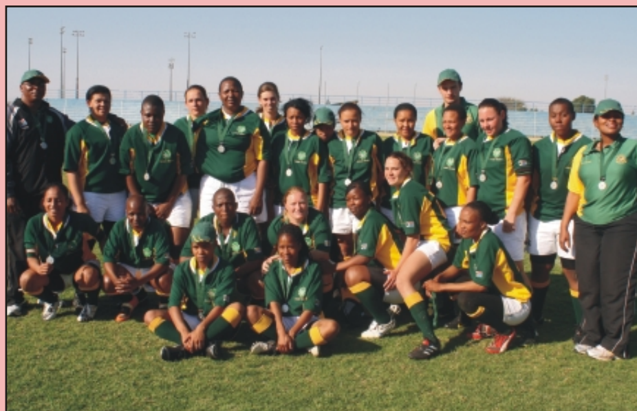
Runners up..... Griquas took the second position at the tournament.