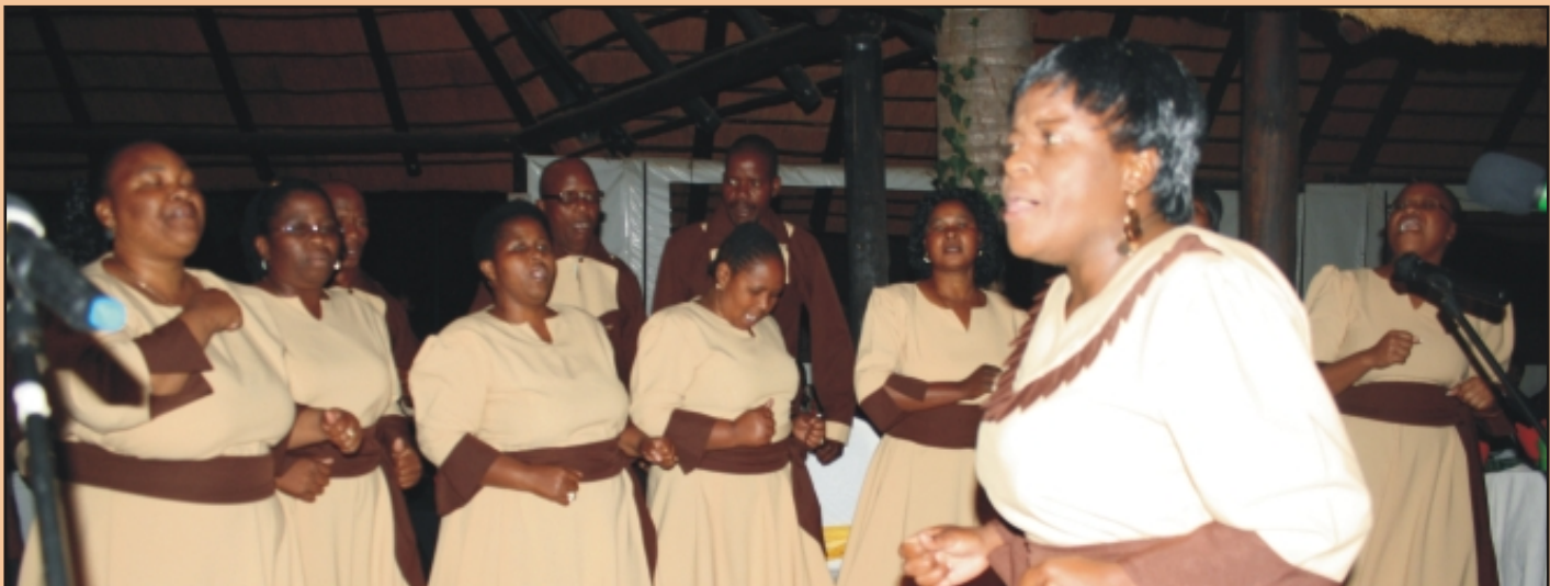
Bidding farewell..... departmental choir singing at the farewell function.